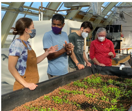
As part of the eeBLUE Aquaculture Literacy Mini-Grants Program, science teachers from Brunswick High School in Maine explore the Canopy Farms aquaponics facility.