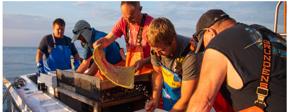
The AquaFort, a 2018 Sea Grant-funded marine aquaculture research project, engages local fishermen in the daily operations of raising steelhead trout, mussels and sugar kelp in a marine aquaculture platform located at the mouth of the Piscataqua River near New Castle, NH.