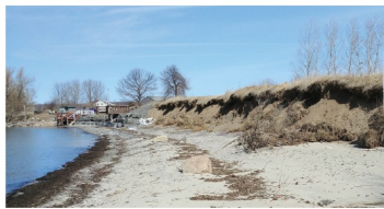
Options of shoreline management options on Chautauq Bay, NY.