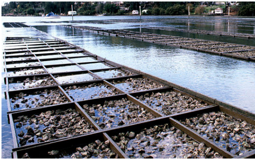
Many Sea Grant programs, including Delaware Sea Grant have revived shellfish aquaculture in their area.

After 20 years of applied research, extension and education programs, Delaware Sea Grant and partners have revived commercial shellfish aquaculture in Delaware's Inland Bays. Though Delaware has a rich history of shellfish aquaculture, the practice was terminated in 1979 due to a disease outbreak that devastated oyster abundance. Thirty-eight years later, in 2017, Delaware opened nearly 350 sites for shellfish farming and, in 2018, saw the first commercial sales of farmed oysters in 20 years. From researching disease-resistant oysters, to helping create laws and regulations that allow Delaware shellfish aquaculture and helping growers raise and market oysters, Delaware Sea Grant played an integral role in the return of shellfish aquaculture.