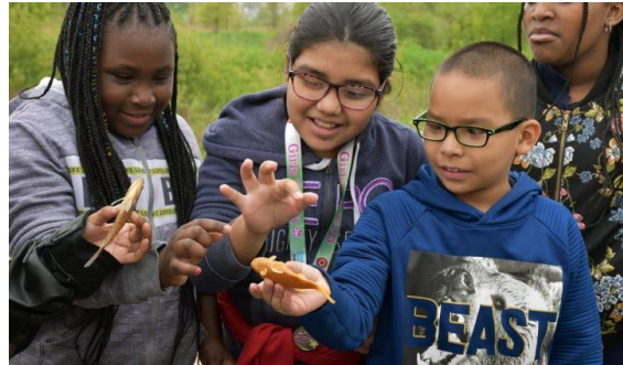
Photo Highlight: Illinois-Indiana Sea Grant Connects Kids with Fish

The 2018 Fall American Geophysical Union (AGU) meeting will include several citizen science sessions. The deadline to submit abstracts is August 1, 2018. More Info