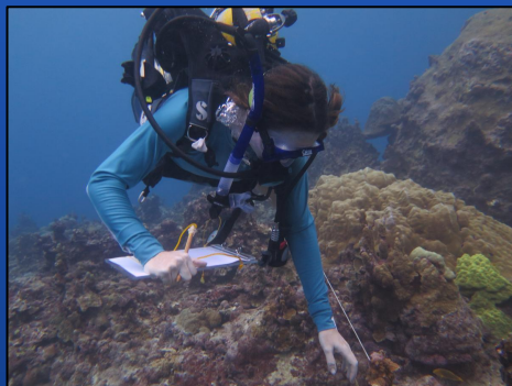
SC Sea Grant