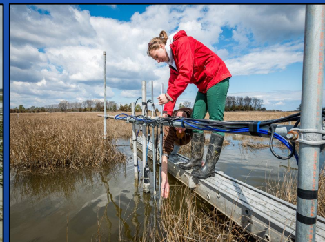
DE Sea Grant