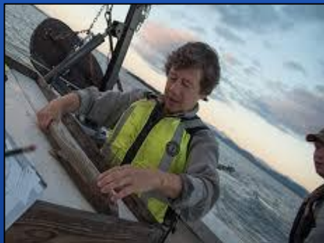
LC Sea Grant

What are common mistakes when completing the Questionnaire?