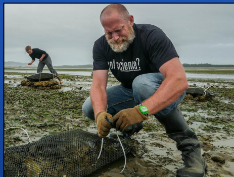
OR Sea Grant