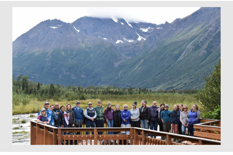
Photo: Participants pose for a photo at the Eagle River Nature Center.

Representatives from the seven Pacific Sea Grant programs gathered last week in Anchorage, Alaska for their first regional gathering in eight years.