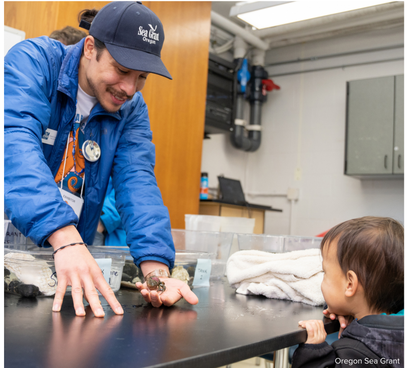
Oregon Sea Grant

IN 2022, A FEDERAL INVESTMENT IN SEA GRANT OF $89.5 MILLION RESULTED IN $802.3 MILLION ECONOMIC BENEFIT*